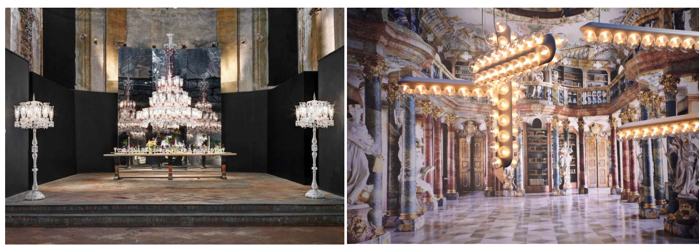
Baccarat at San Carloforo – Prop Lights by Bertjan Pot for Moooi in Zona Tortona

An austere church as counterpoint to the flamboyant luxury of Baccarat, and the photographs of Baroque interiors by Massimo Listri as a backdrop to the Moooi Collection.