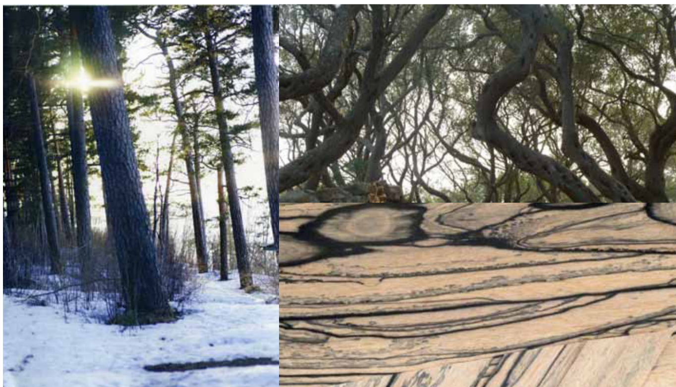
Photographs 2013 (Brigitte Saby)/ Ebene Blanc (Zoom)

From the snow-covered forests of Moscow to the knotted branches of a sun-bleached Greek glade, Trees – to Brigitte Saby – are imbued with a graphic, carnal presence, magnified by the plays of white and shadow that typify her approach.