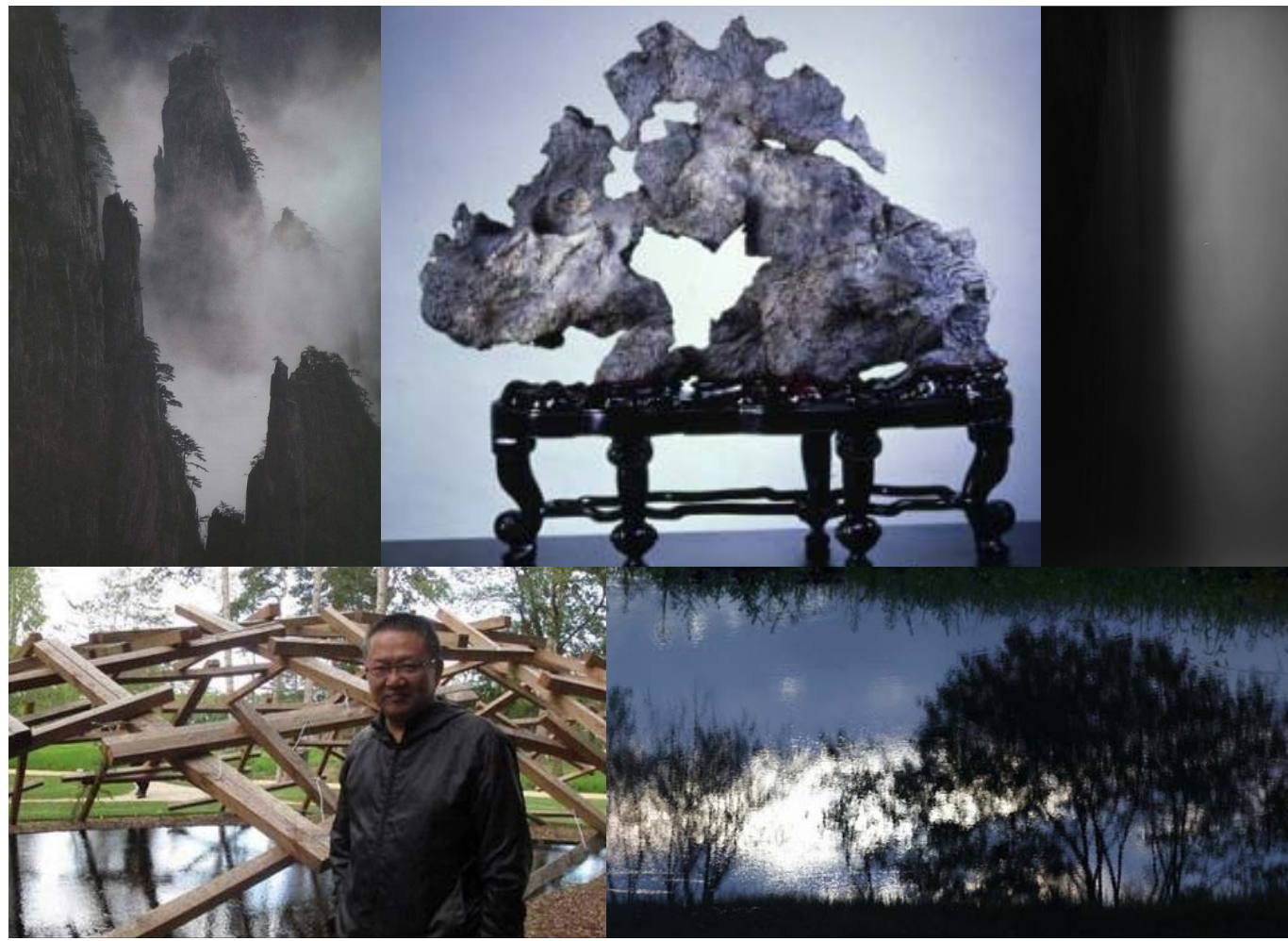
Marc Riboud: Huangshan , the 'Artists' Mountain' - Literati Stone in form of a cloud (Asian Art Museum, Nice) Sugimoto: Vertical Seascape (2013) - Clouds installation by Pritzker Prize-winning architect Wang Shu (Chaumont 2012) Ahae: From My Window (Versailles 2013)

Clouds are everywhere in Asian art: moving yet soothing, feminine yet inseparable from mountains, 'plastic' yet intangible... an endless source of inspiration for poets and literati, photographers and contemporary architects: