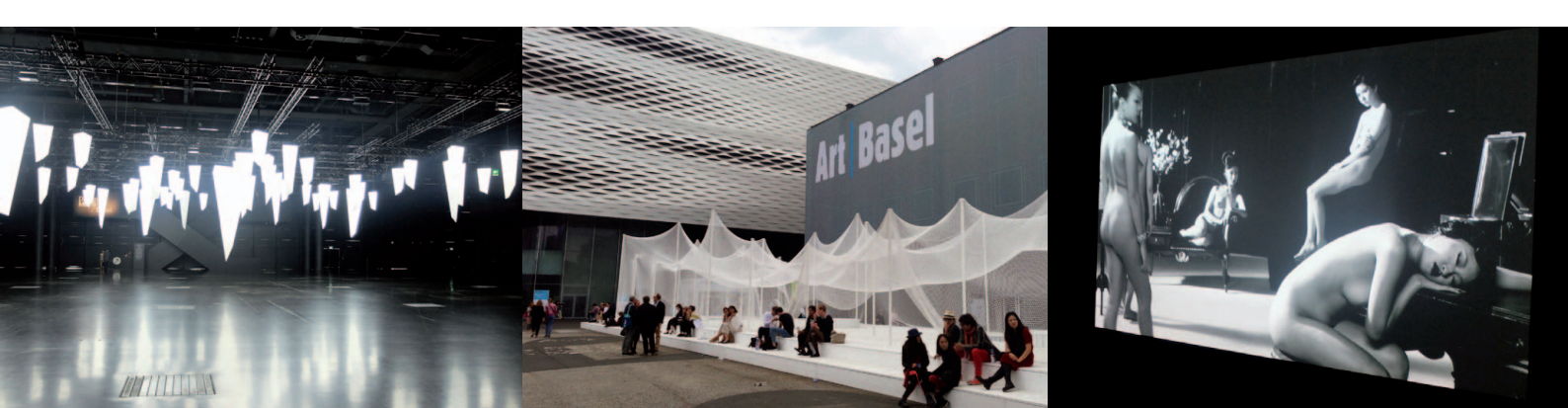
Basel (above): Jamie Zigelbaum; Yang Fudong; New Women . Venice (below): Arsenal Entrance; Fundamentals Pavilion at Giardini (balconies, doors); Jacques Tati's Villa Arpel at the French Pavilion

Design Basel is assuming more and more importance within Art Basel. An airy netted canopy tops the seating outside, beneath Herzog & De Meuron's superb, shimmering façade. Before actually reaching the exhibiting galleries, visitors are plunged into a mysterious ambiance by an installation of acrylic stalactites. In Art Unlimited, the hall devoted to museum works, New Women conjure up the sensuous lunar atmosphere of fantasy Shanghai.